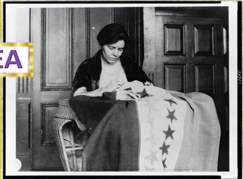
Alice Paul is shown sewing the thirty-sixth star on the suffrage ratification banner, the stars having been added from time to time as the various states ratified.

Oaknoll Clubhouse 300 Mc Cloud Ave. Thousand Oaks, CA 91360