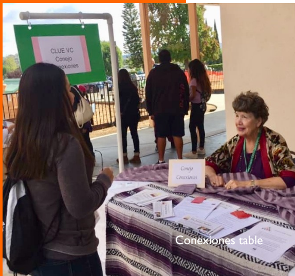
Conejo Conexiones table