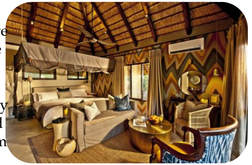
Sabi Sands Bush Camp

To conclude the trip, the family spent three days in Johannesburg. They had a tour of the city, Constitutional Hill, and historical sites such as the township of Soweto. It was Election Day and a National holiday in South Africa so that people are able to vote easily. The family did have the trip of a lifetime and were glad to be back home again, but the memories of South Africa will linger for a long time.