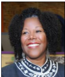
Ruby Bridges (1954 - ) Civil Rights Activist