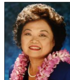
Patsy Mink (1927 - 2002) U.S. House of Representatives, Hawaii