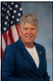
Congresswoman Julia Brownley 26 th District of California (tentative participant)