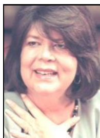
Wilma Mankiller (1945 - 2010) Chief of the Cherokee Nation