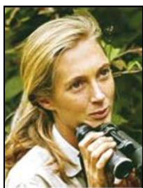
Jane Goodall (1934 - ) Primatologist