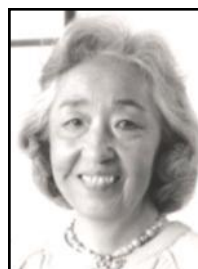
Yoshiko Uchida (1921 - 1992) Author, WWII Japanese-American Internee