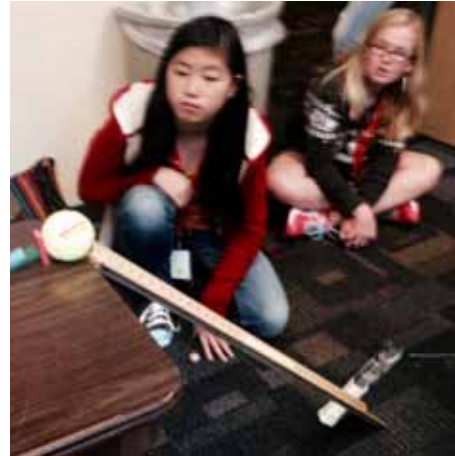
Two Tech Trek campers working on a project to teach cause and effect