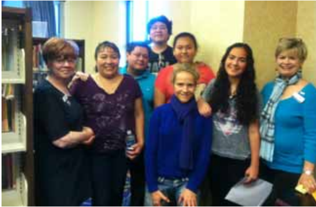
Two Tech Trek girls and their families at Orientation.