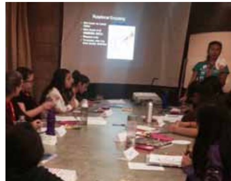
Do you know what "Rotational Encoding" is? Well, these Tech Trek campers sure do!