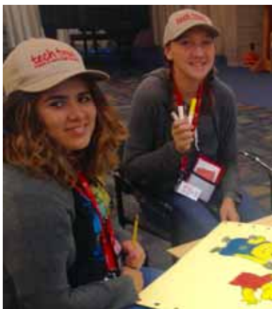
Two senior counselors completing a poster project for the dorm.