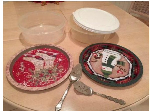
There was also a toothpick holder left. Please contact Liz Priedkalns to claim.

Thanks to all of those who attended to make this a successful holiday celebration!