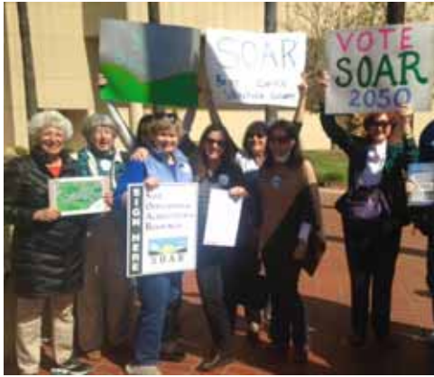
Tuesday, March 29 - AAUW SOAR workers helped turn in 35K petitions to County Recorders office.