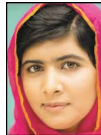
Malala Yousafzai (1997 - ) Youth Education Activist, 2014 Nobel Peace Prize Recipient

The presentations will be followed by a short video about Malala Yousafzai.