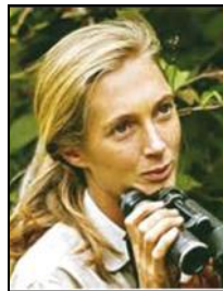
Jane Goodall (1934 - ) Primatologist