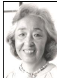
Yoshiko Uchida (1921 - 1992) Author, WWII Japanese-American Internee