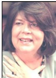
Wilma Mankiller (1945 - 2010) Chief of the Cherokee Nation